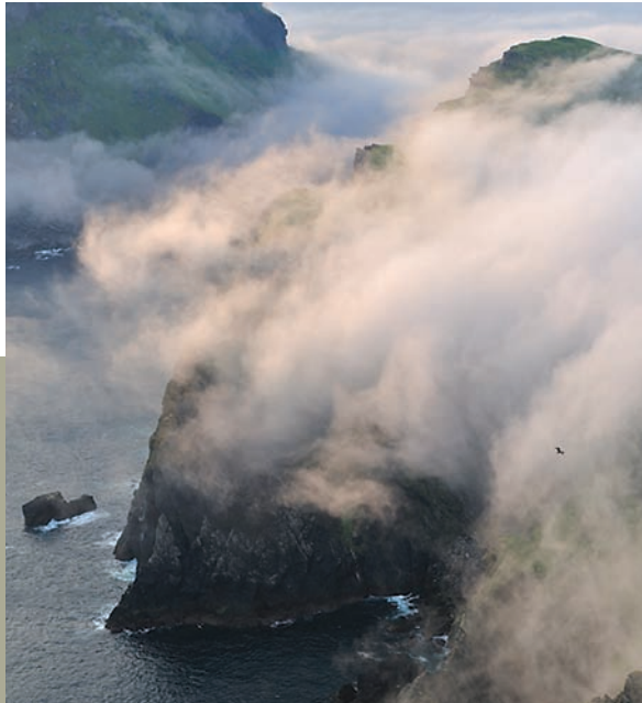
St Kilda

Front cover: Cleit above Village Bay. Fulmar and Thrift. Islanders