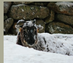
Soay sheep