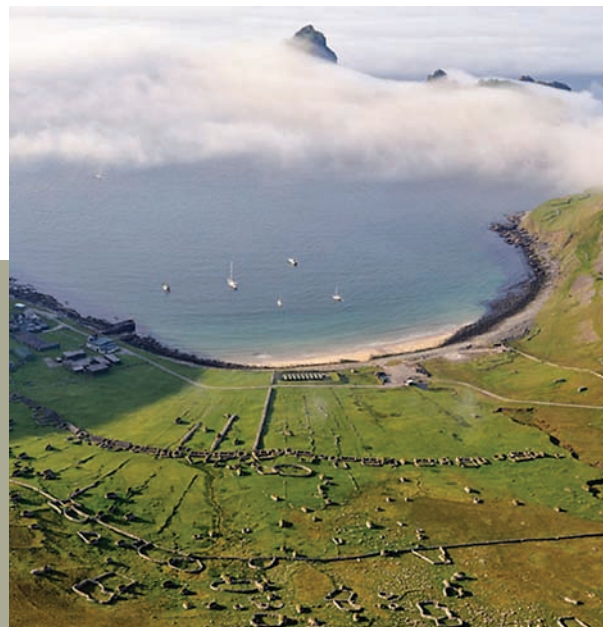
Village Bay

In July 2005, St Kilda became one of a few World Heritage Sites to hold dual status for both its natural and cultural qualities.