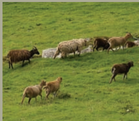
Soay sheep