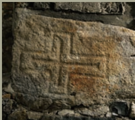
Early Christian cross