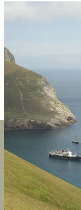
Visiting cruise ship